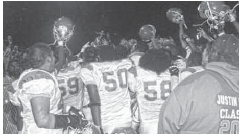
Hawthorne football players celebrate with Mayor's Trophy in background after their 44-8 victory over cross-town rival Leuzinger last Friday.